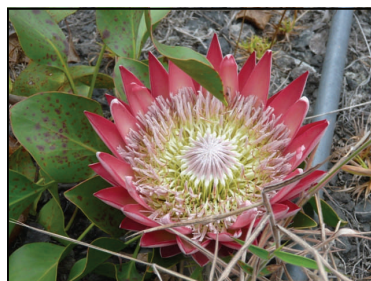
Top Left, lower left and lower right: Protea flowers, some of many varieties we have seen at the plant nursery and in the surrounding protea fields.