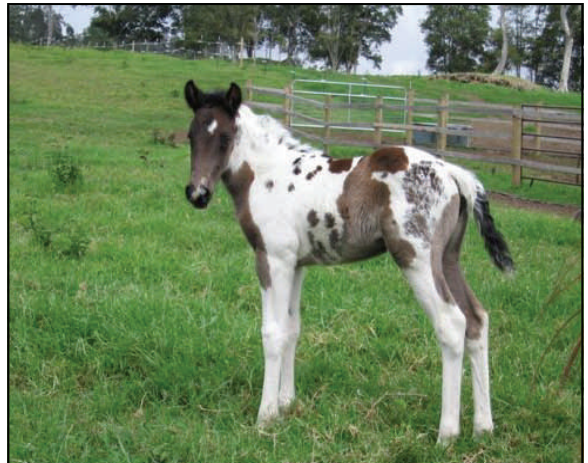
One of the newest guests at the Mare Motel