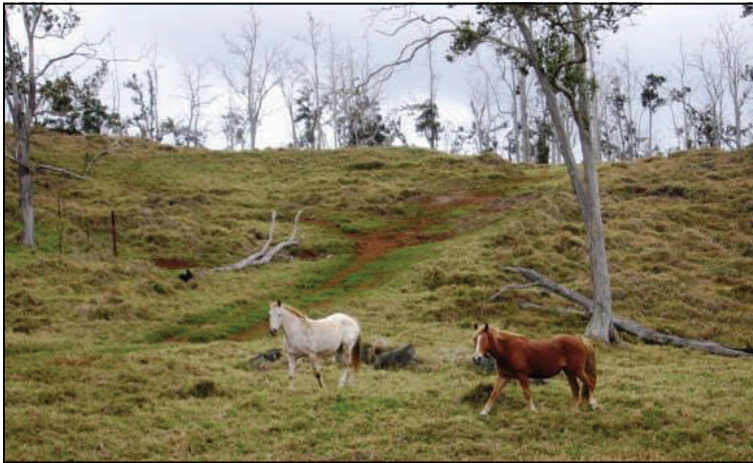
Guests of the Mare Motel enjoy their space.