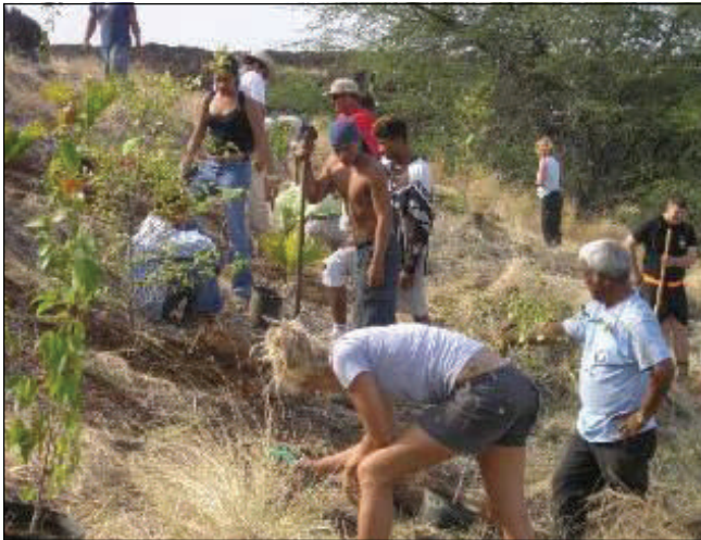
Volunteers, the life blood of this project, are hard at work planting native species and pulling out invasive fountain grass.

West Hawaii Veterans' Cemetery is also known as the "Arlington of the Pacific". It was established in 1997 with the County of Hawaii responsible for its maintenance. Veterans and community volunteers joined forces in 2004 to address the poor conditions of the cemetery which included "dust bowl" conditions and grave sinkage. These unsung heroes formed the West Hawaii Veterans' Cemetery Development and Expansion Association (WHVCDEA) to beautify and reforest the cemetery.