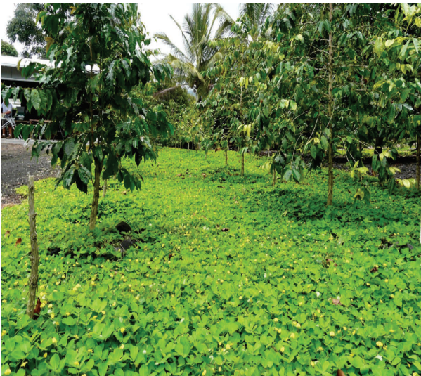
Above: A local farm that has had success in establishing perennial peanut as a ground cover.

The talk was well attended by approximately 20 individuals from local farms. They learned that perennial peanut has its challenges in getting established, but once it is, it's good at weed suppression and fixing nitrogen from the air so that it is available to plants.