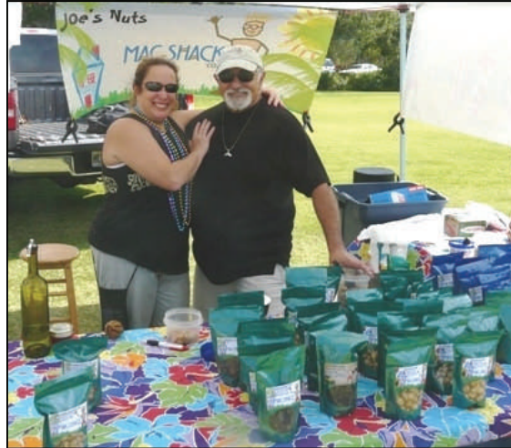
(Above left) Aloha Aina Farms (aka mac-shack)-, a local producer selling a variety of mac nuts from un-salted to spicy. They also have other mac nut products, sell their own coffee and even sell T-shirts with their really cool logo.