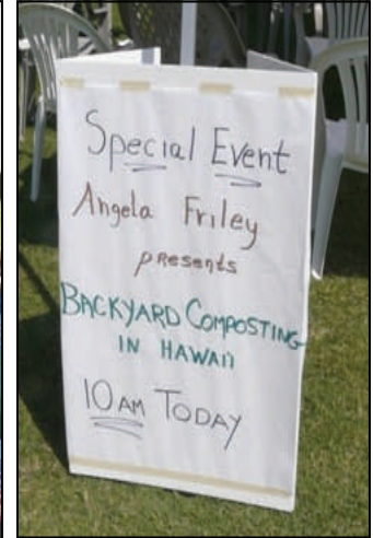
Above right is information on the day's special event. Each week the special event is different so stop by and find out about this week's special event.