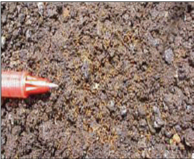
In the above picture there are actually hundreds of Little Fire Ants. They are tiny, about 1/16th of an inch, the thickness of a penny.

You might think it is a pain in the neck to do this testing but trying to eradicate LFA is much more difficult. LFA is also a disclosure requirement issue if you decide to sell your property so it is important to take steps to prevent them.