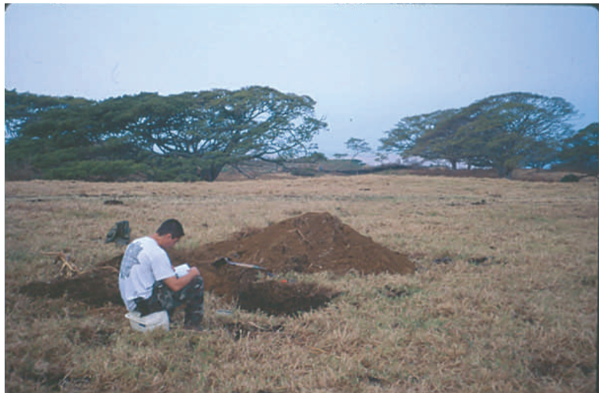
Photo 2. Kainaliu soil series used for pasture.