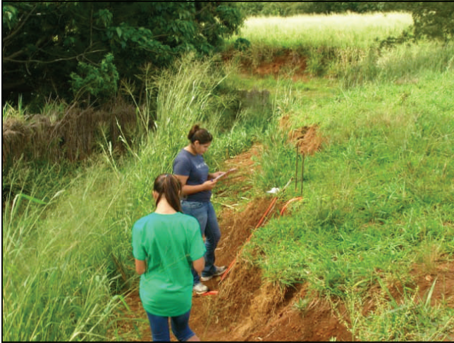
(Left): Students judging soil characteristics . They will then make recommendations regarding the land uses this landscape is suitable for.

check, please make the check payable to the East Kauai SWCD and note on the memo line, National Conservation Awareness Contest.