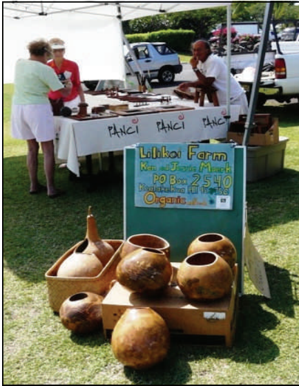
Above is Liliko'i Farm, one of the local vendors at Wednesday Market offers many value added products.

The Kona County Farm Bureau celebrated the Keauhou Farmers Market's 4th birthday in December. It also celebrated the birth of its Wednesday Market. Wednesday Market takes place on the property of the Sheraton Keauhou Bay Resort and Spa and will feature locally grown vegetables, fruits, flowers, nuts and 100% Kona Coffee. You will also find value-added products that primarily have ingredients or materials coming from Hawaii Island's land or waters. Stop by the Sheraton Keauhou Bay Resort and Spa from 8am—noon on Wednesday and see what it is all about.