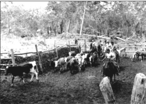
In the photo to the left, paniolo are working over wild cattle. Bulls are separated from the cows and the cows will be spayed, ear-marked and turned out again to raise their calves. Some later round-up will bring these cows out for fattening for market. The bulls of the round-up went Makai to the fattening pad. (The date of this photo graph is 8/30/1956)