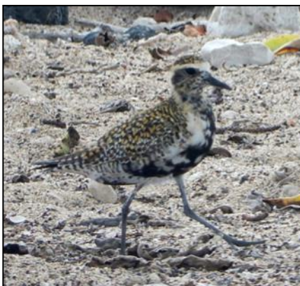
Such a cool bird and fairly easy to spot if you know what to look for. This one is likely to be an adult male changing into its "breeding" plumage

When you are out and about, if you see these amazing, ponder their flying strength and navigation skills.