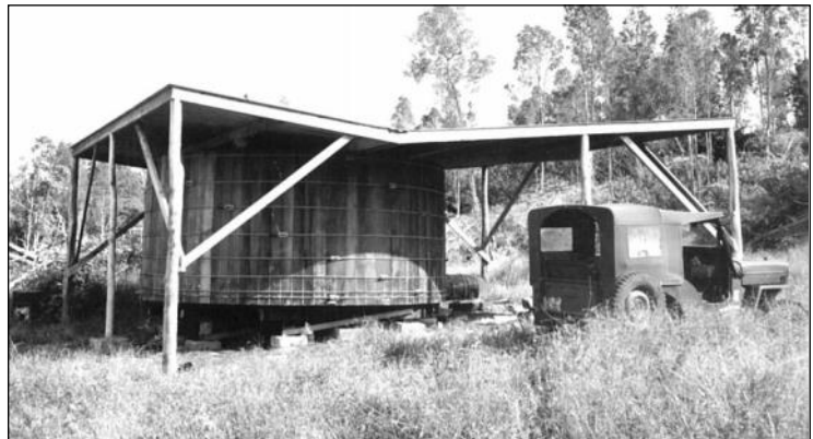
The photo to the right is a 10,000 gallon redwood tank with a rain shed structure. Most storage tanks today are fabricated out of steel. (The date of the photo is 9/26/57)