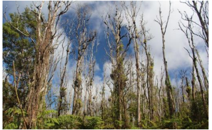
Above is what is left of a stand of Ohia trees after Rapid Ohia Death. Almost as far back as you can see there are dead trees. This is a sad reality for forest land owners.

The ambrosia beetles are attracted to the dead and dying 'ōhi'a and bore into the wood. The beetles produce a fine sawdust as they drill and push it to the outside of the tree. Sometimes ambrosia beetle